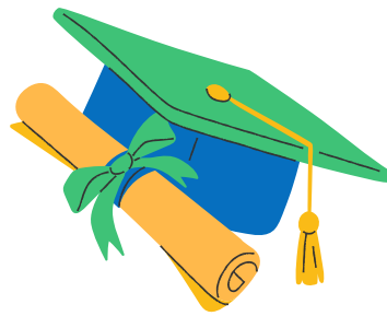
Level of education